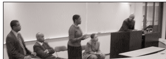
Panelists and Minorities in the Profession Committee members at the "So You Want To Be A Lawyer?..." Event