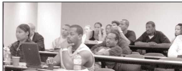
Georgia State University School of Law students listen to panelists at a Minorities in the Profession co-sponsored event "So You Want To Be A Lawyer?..."

Butler, Wooten, Fryhofer, Daughtery and Sullivan Hunton & Williams Alston & Bird Kutak Rock King & Spalding.