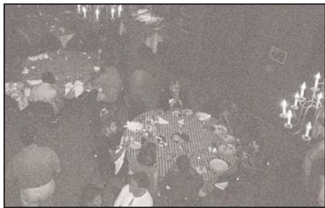
YLD Group Dinner at the Sportsman's Lodge