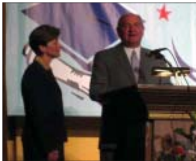
Top: The Celebration of Excellence honors 2004 graduates at the Fox Theatre on June 10.