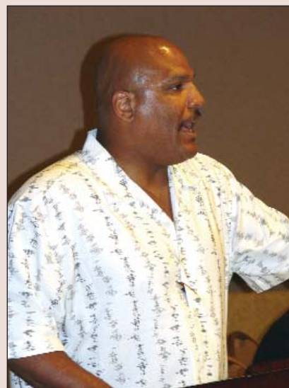
Judge Gino Brogdon