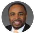
Prince N. Njoku