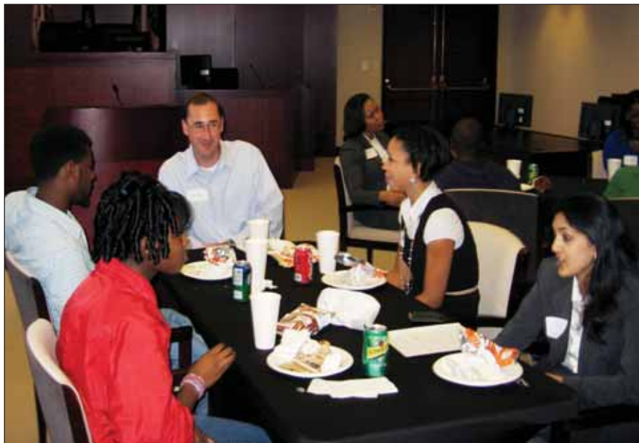
Alston & Bird LLP partners, associates and summer associates provided one-on-one mentoring to the Pipeline students.