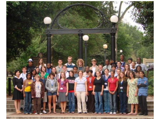
2008 Law Scholars at the Arch in Athens

The Georgia High School Mock Trial Competition helps students gain an understanding of the legal system by providing opportunities for school teams to participate in academic competitions where players assume attorney and witness roles in a court case. Lawyers coach students in developing questioning, critical thinking and oral advocacy skills.